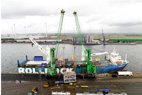
CAPTION: Discharging operations at the Port of Antwerp, Belgium