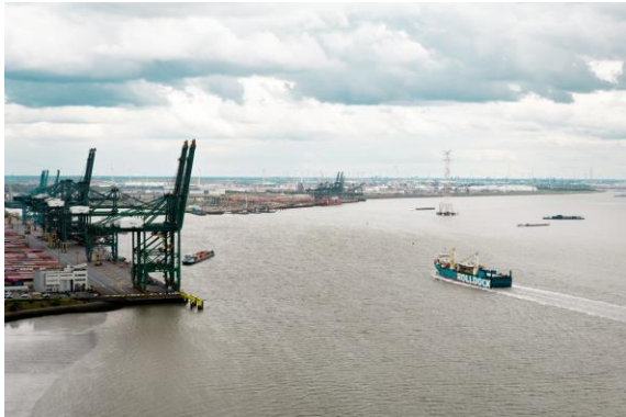
CAPTION: Cargo arriving at the Port of Antwerp, Belgium

Please use the image related to this news announcement with the following caption: