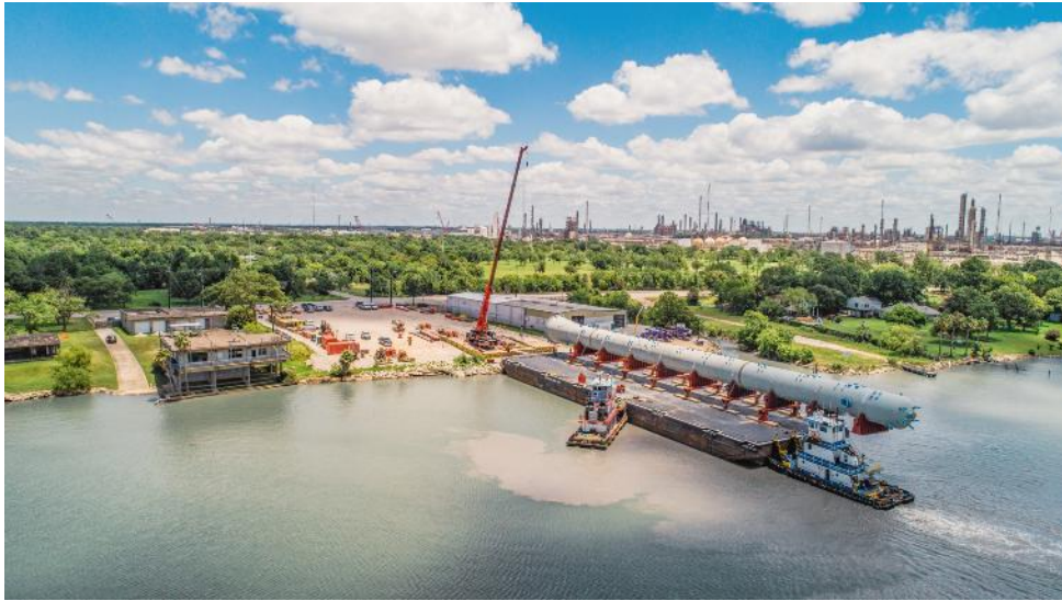
CAPTION: The Houston office of deugro USA delivering critical petrochemical equipment to Scott Bay, Texas, USA