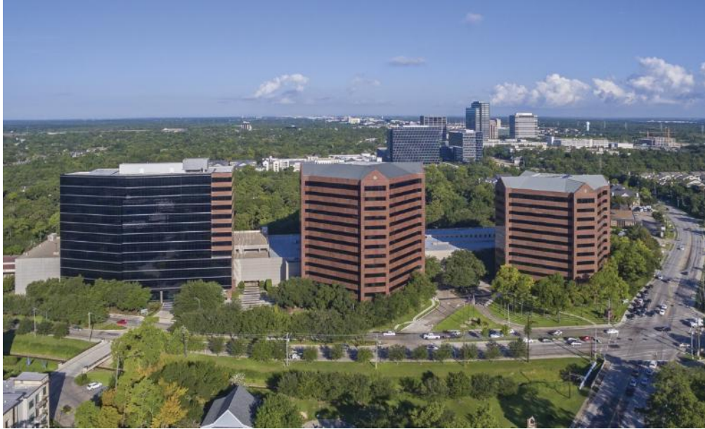
CAPTION: New office location situated at 757 N Eldridge Parkway, in Houston, Texas, USA