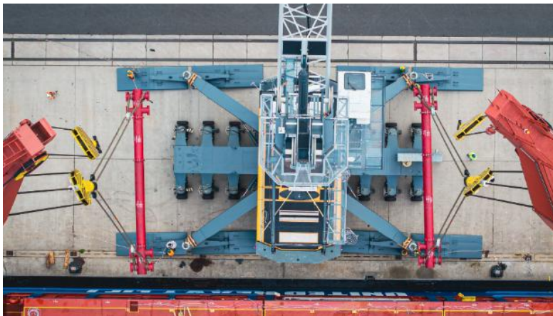
CAPTION: Lifting preparations for a Liebherr LHM 550 crane