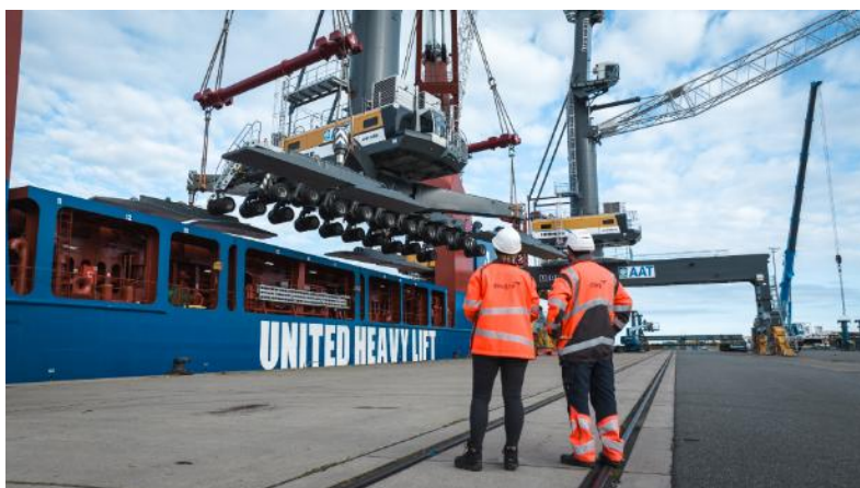
CAPTION: Lifting of a Liebherr LHM 550 crane at the Port of Rostock, Germany