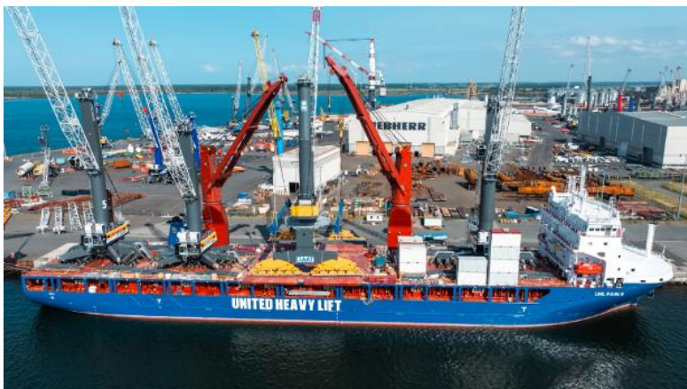
CAPTION: Loading operations at the Port of Rostock, Germany