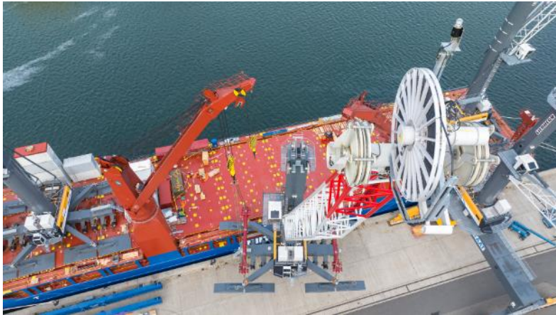
CAPTION: Lifting of a Liebherr LHM 550 crane at the Port of Rostock, Germany