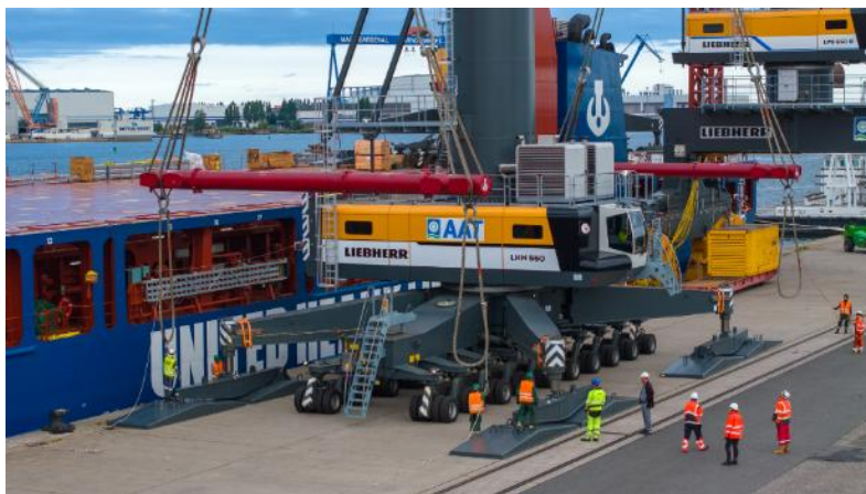
CAPTION: Lifting preparations for a Liebherr LHM 550 crane

Please use the images related to this press release with the following captions: