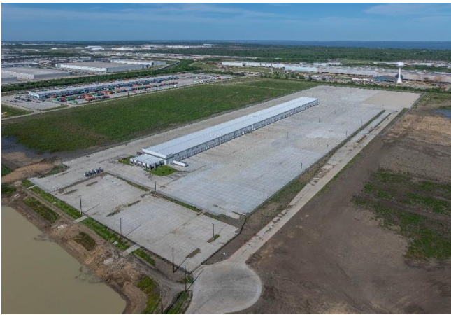
CAPTION: Cedar-Port Operations and Logistics Terminal—COLT, Cedar Port Industrial Park, Baytown, Texas, USA