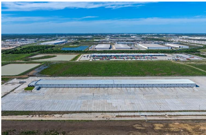
CAPTION: Cedar-Port Operations and Logistics Terminal—COLT, Cedar Port Industrial Park, Baytown, Texas, USA