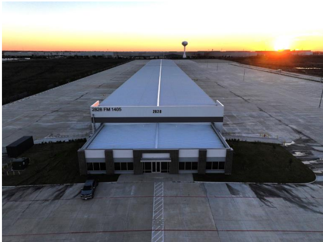
CAPTION: Cedar-Port Operations and Logistics Terminal—COLT, Cedar Port Industrial Park, Baytown, Texas, USA

Please use the images related to this press release with the following captions: