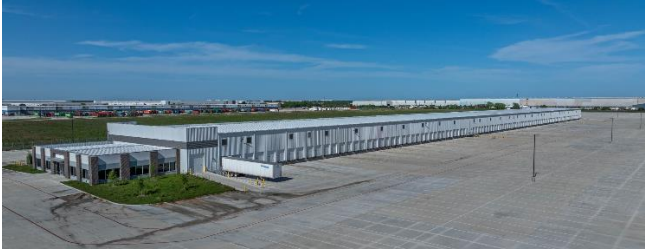
CAPTION: Cedar-Port Operations and Logistics Terminal—COLT, Cedar Port Industrial Park, Baytown, Texas, USA