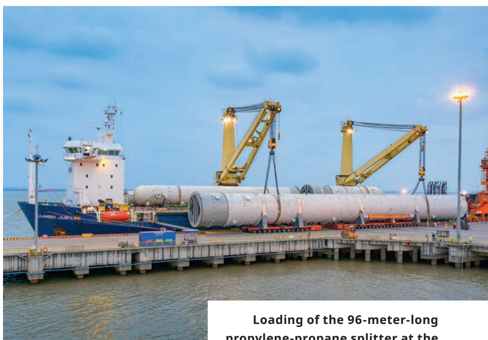
Loading of the 96-meter-long propylene-propane splitter at the Port of Zhangjiagang, China