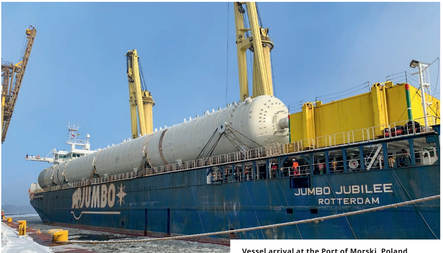
Vessel arrival at the Port of Morski, Poland

The project preparation spanned a period of approximately one year, because deugro Korea and its subcontractors had to carry out extensive civil works to enable the project delivery. These included the construction of new roads and a temporary 650-metric-ton bridge, several road widenings, the installation of foldable streetlamps, the movement of steam pipes