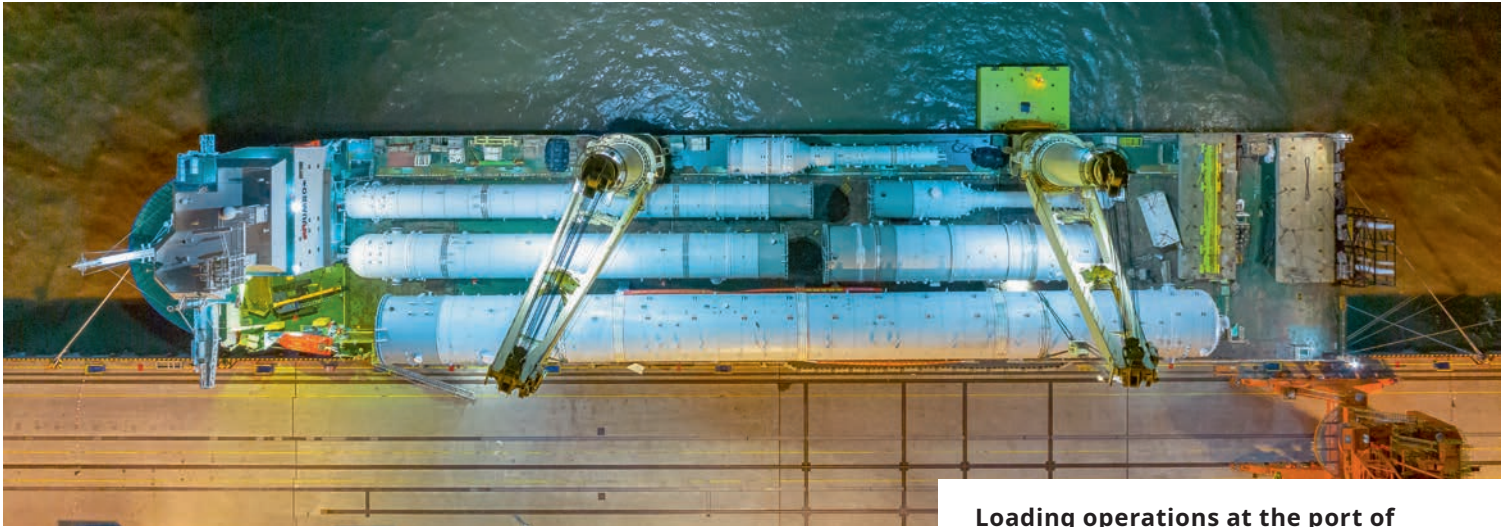
Loading operations at the port of Zhangjiagang, China

Performance On time, within budget, without QHSES incidents