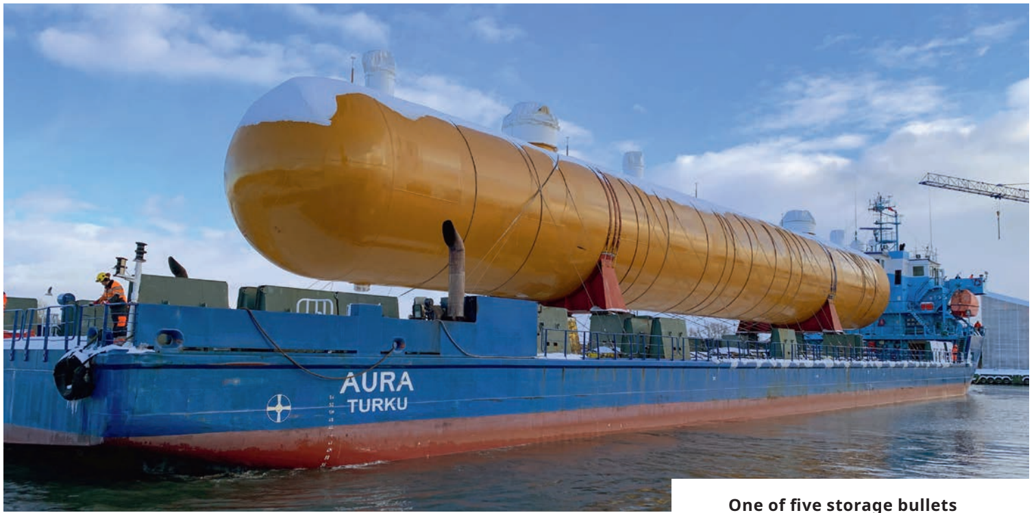
One of five storage bullets arriving at the Barkowy jetty