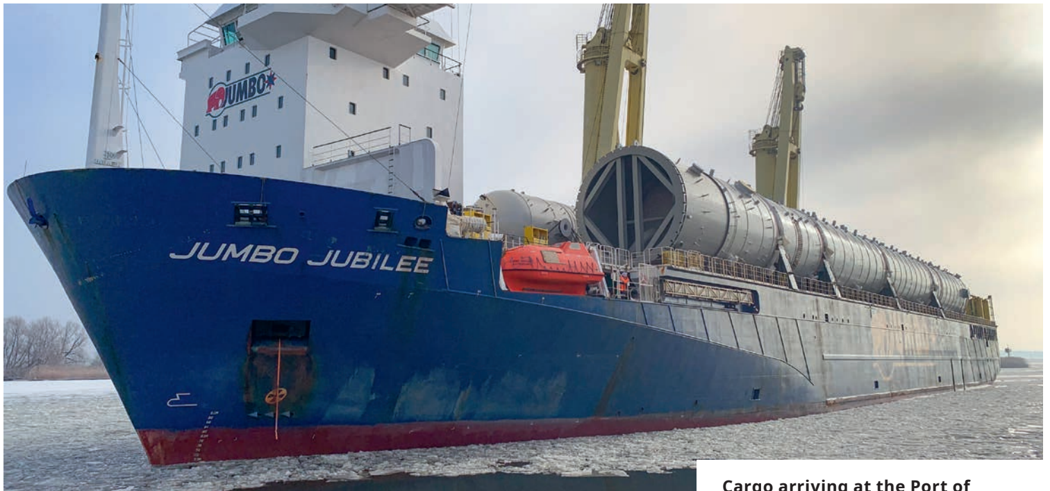
Cargo arriving at the Port of Morski, Poland

The biggest challenge was the loading of the 889-metric-ton propylene-propane splitter, with impressive dimensions of 96 x 9.35 x 8.90 meters, and the five 72.13-meter-long, 613.98-metric-ton propylene storage bullets, as well as further OSHL cargo units. Again, the stowage capacity and the