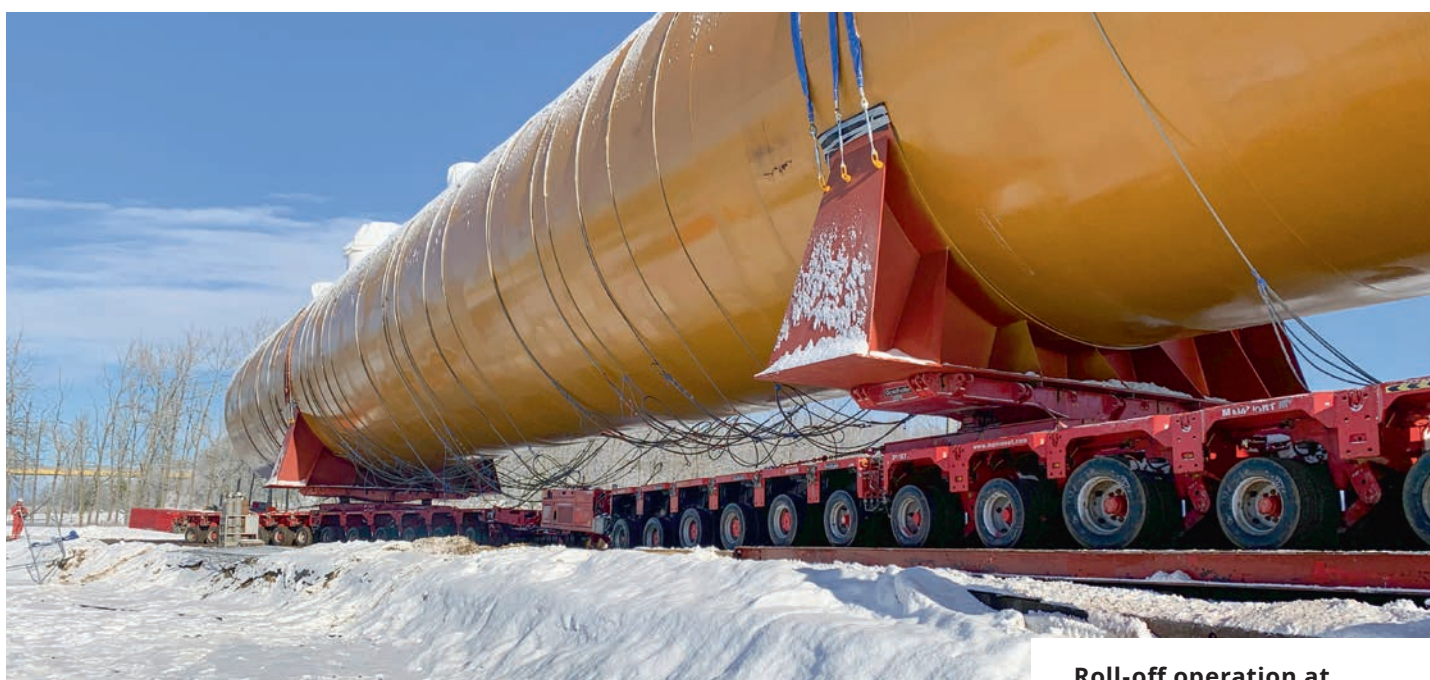
Roll-off operation at the Barkowy jetty

Within six weeks and after over 30 barge trips, the discharge operations from all incoming vessels were completed according to schedule and the cargo was delivered to the Barkowy jetty six kilometers away. The discharge operations of the MV Jumbo Jubilee took five days and of the MS Pietersgracht almost 10 days.