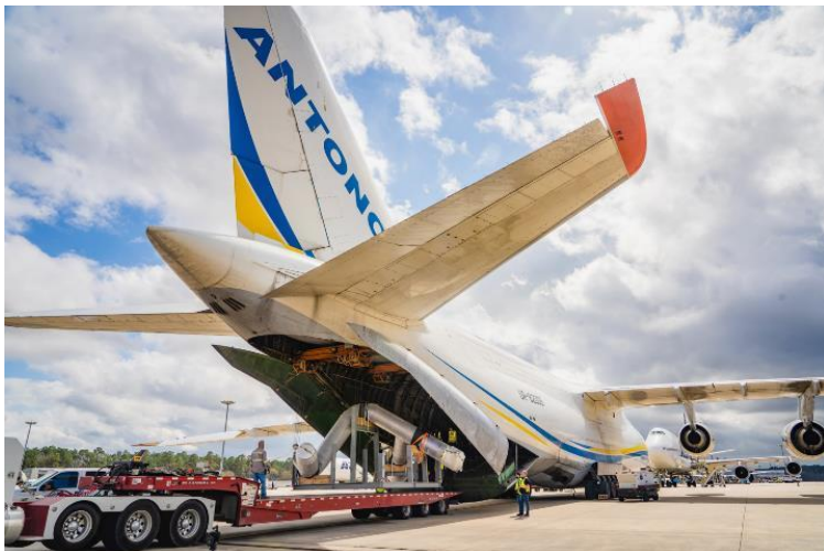
CAPTION: Unloading operations directly onto trailers at Houston Airport, USA