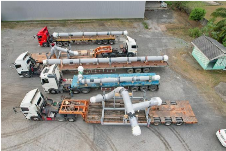
CAPTION: Spools with odd shapes and dimensions fixed at a specific angle in metal frames to allow for loading into the AN-124-100.