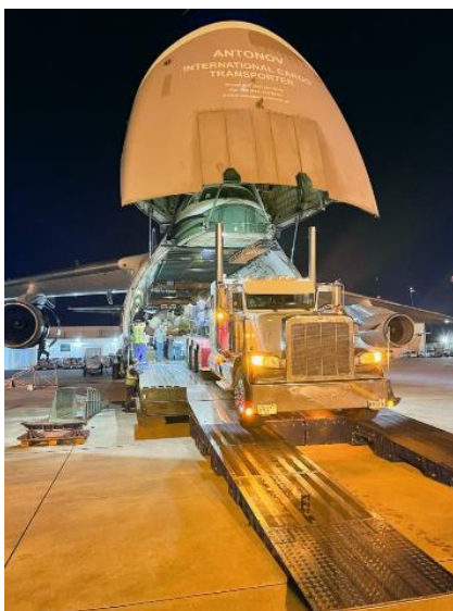
CAPTION: Unloading operations directly onto trailers at Houston Airport, USA