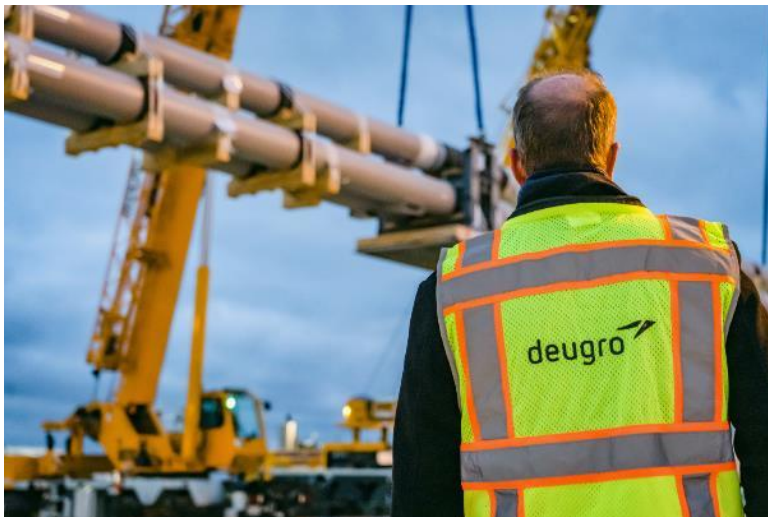
CAPTION: Unloading operations directly onto trailers at Houston Airport, USA, supervised by the local deugro teams