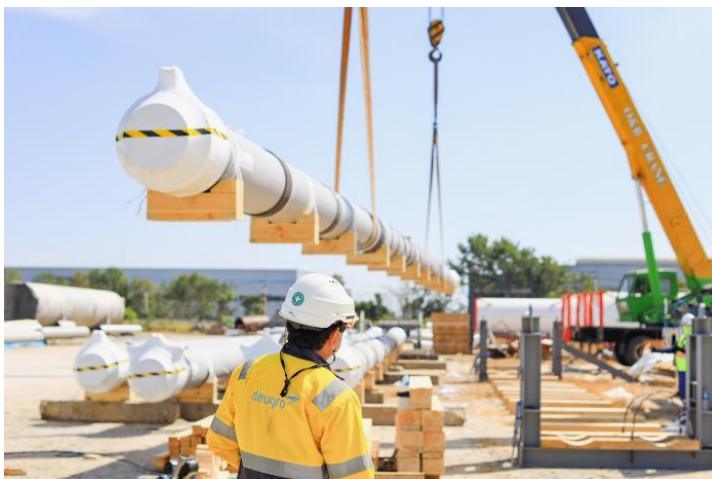
CAPTION: Cargo pickup at the original manufacturer in Rayong Province, Thailand