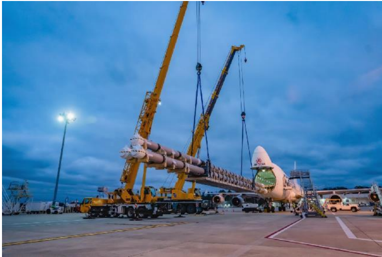
CAPTION: Unloading operations directly onto trailers at Houston Airport, USA