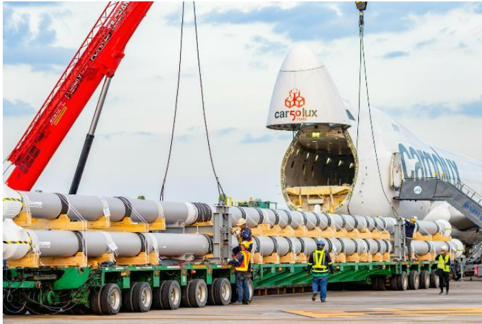
CAPTION: Loading operation of spools of up to 36.6 m in length—one of the longest pieces of cargo ever moved on a B-747 freighter