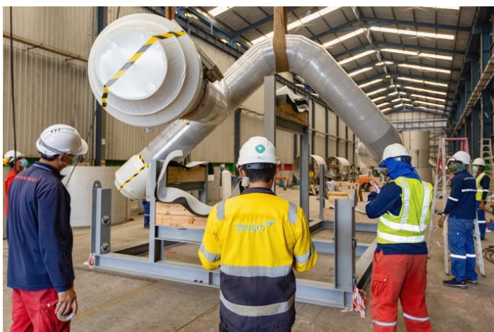
CAPTION: Spools with odd shapes and dimensions were fixed at a specific angle in metal frames to allow for loading into the AN-124-100.