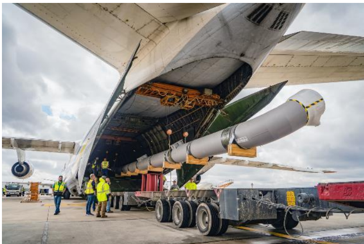
CAPTION: Unloading operations directly onto trailers at Houston Airport, USA