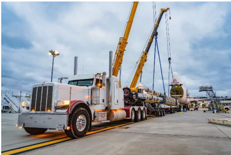
CAPTION: Unloading operations directly onto trailers at Houston Airport, USA