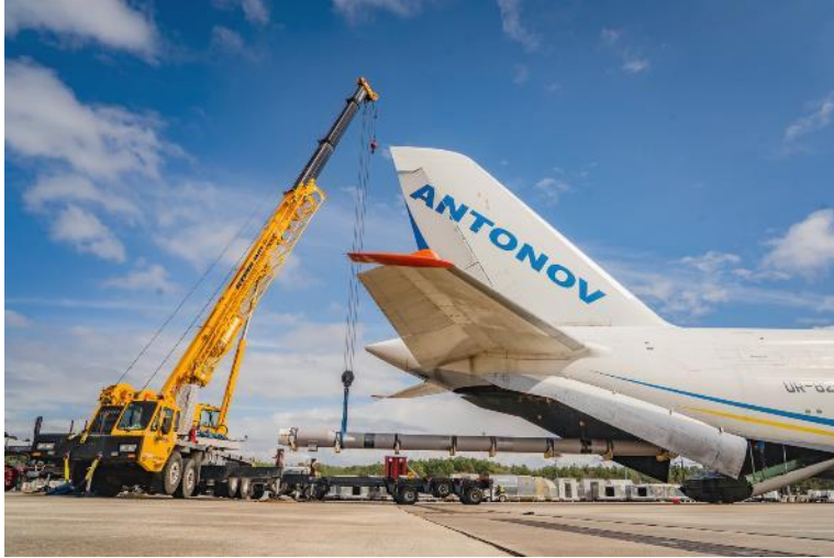
CAPTION: Unloading operations directly onto trailers at Houston Airport, USA