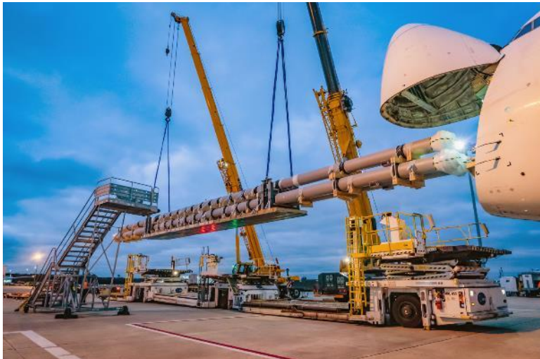
CAPTION: Unloading operations directly onto trailers at Houston Airport, USA