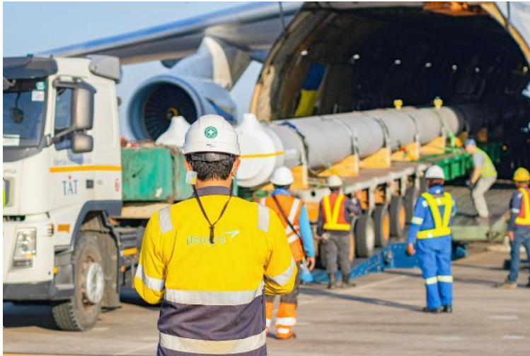
CAPTION: Loading operations at U-Tapao Airport, Thailand, supervised by the local deugro Thailand teams