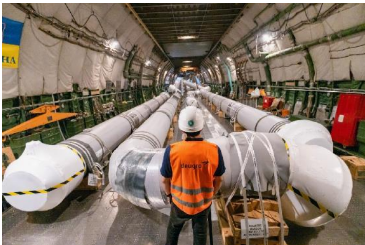
CAPTION: Spools successfully loaded, secured and lashed in the AN-124-100 at U-Tapao Airport, Thailand