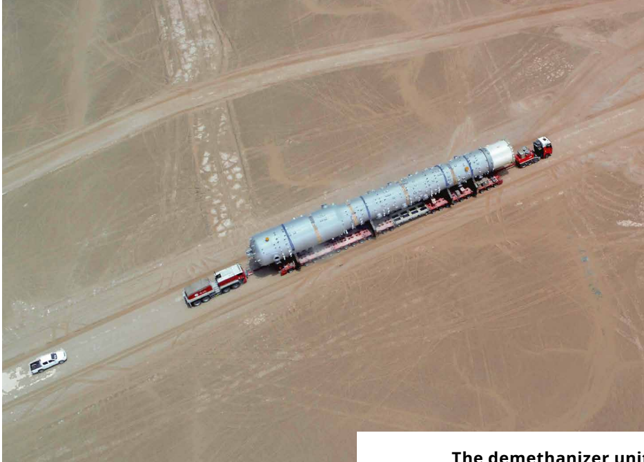
The demethanizer unit traveling a distance of approx. 600 km across the country

which ensured professional and efficient execution.