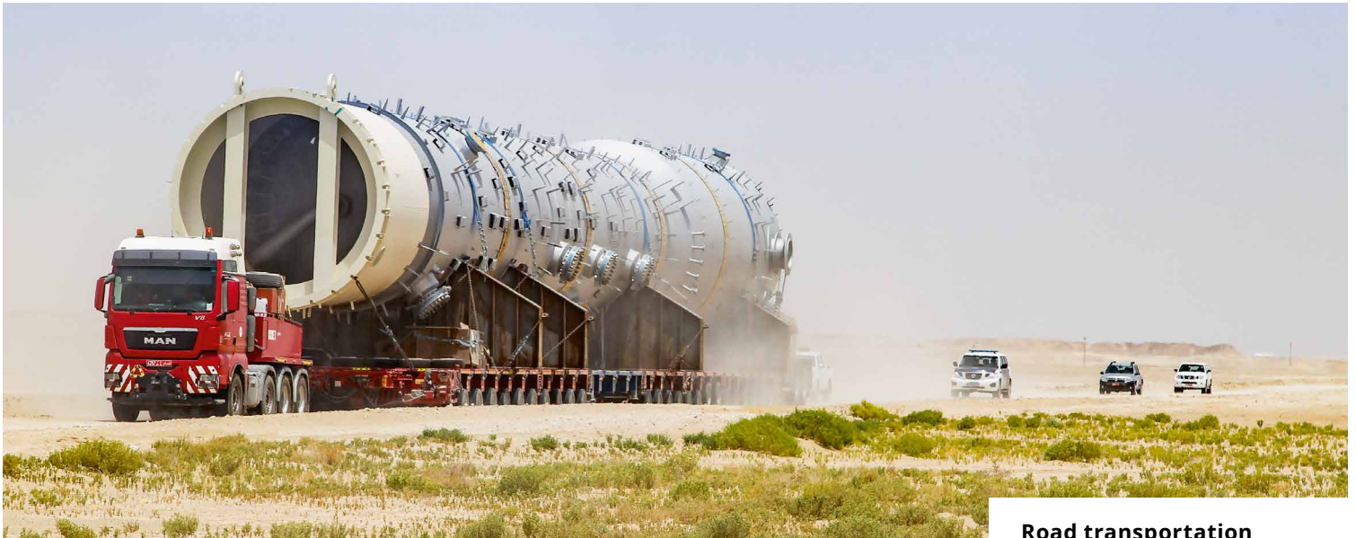
Road transportation of a massive 535 MT demethanizer unit

Zero LTIs and Exemplary QHSES Performance