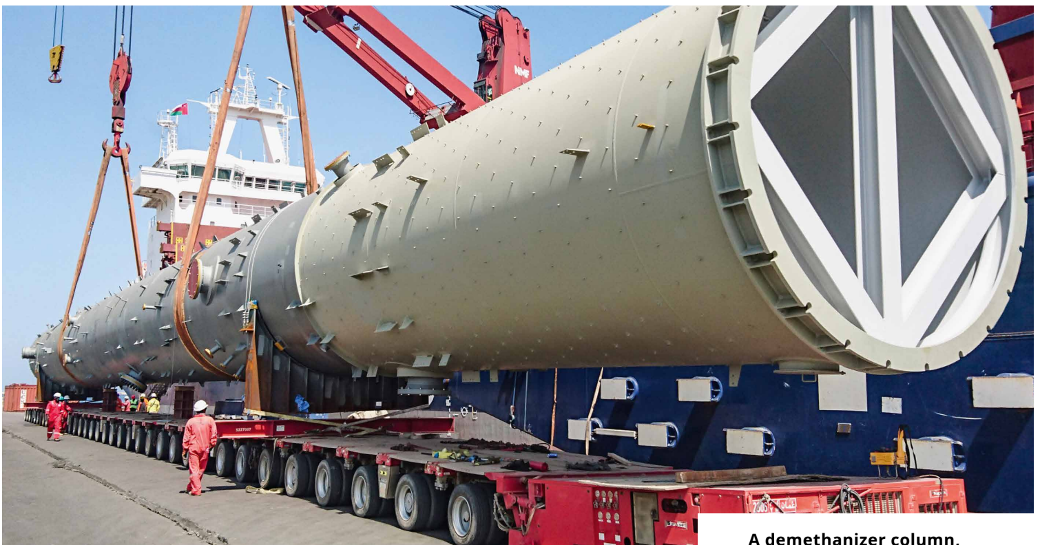
A demethanizer column, with a length of 59.55 m, for the steam cracker unit

The Liwa Plastics Industries Complex (LPIC) Project is a major capital investment project in Oman. The total investment value exceeds USD 6 billion, with financing provided by multiple international Export Credit Agencies (ECAs) from Europe and Asia. Owned by ORPIC (Oman Refineries & Petrochemical Company LLC), it shall increase Oman's production of petrochemicals and increase fuel production, generating 450 direct jobs and over 1,200 indirect jobs in Oman to have a positive effect on the Omani economy.