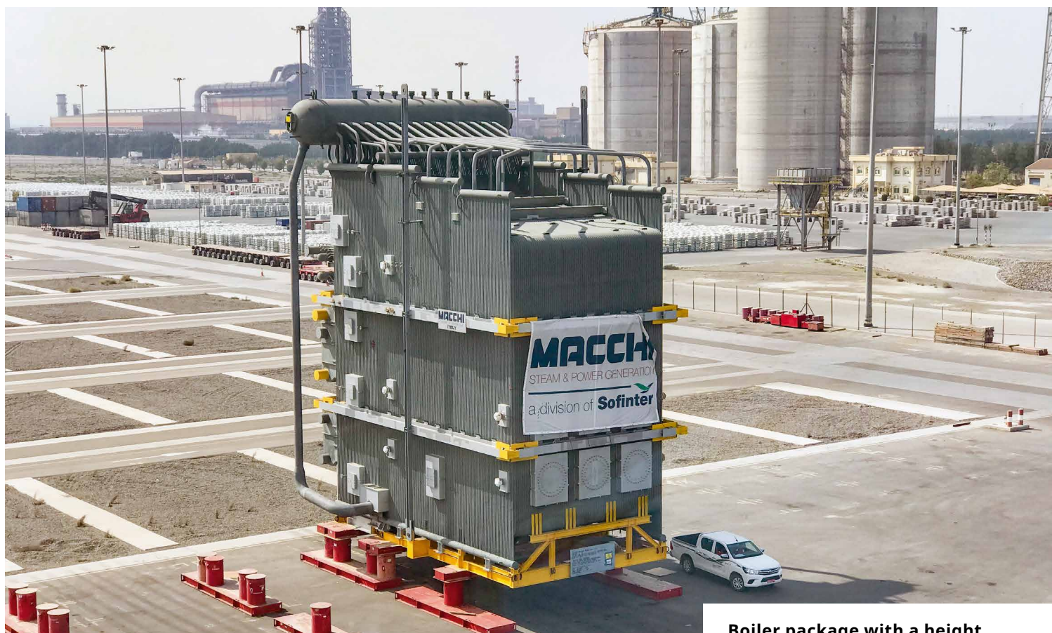
Boiler package with a height of 17.4 m on stools

» We offered cost-saving initiatives while increasing operational and schedule assurance for various critical shipments. «