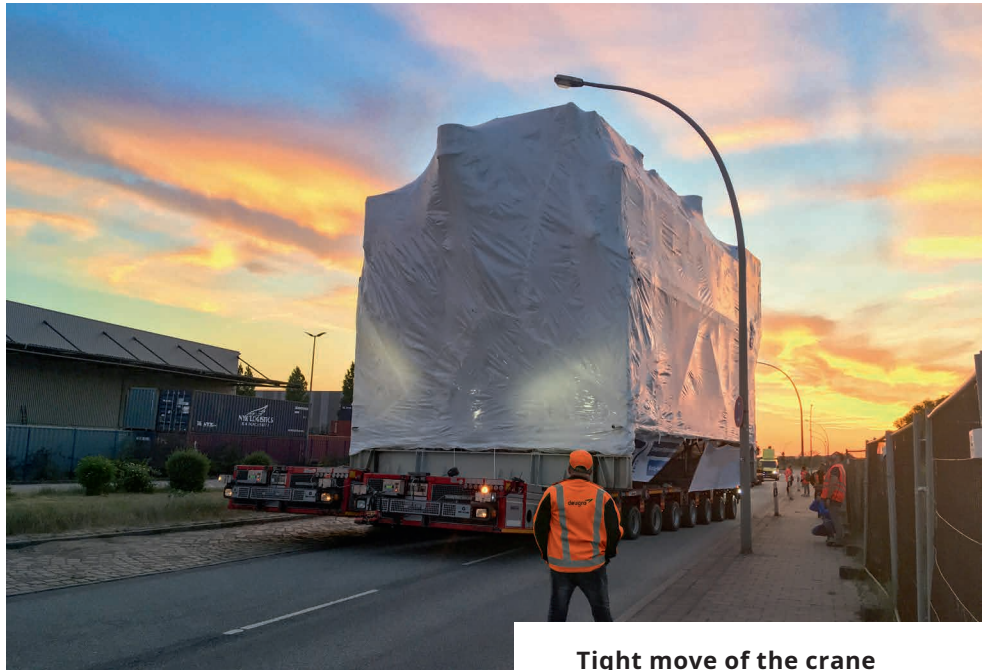
Tight move of the crane trolley under a lamp pole in Hamburg, Germany

Due to an increase in weight, the transport could no longer be arranged on low-bed trailer as previously planned. SPMTs were required instead. Furthermore, final dimensions necessitated alternative routing due to height restrictions. In close cooperation with the client, dteq and the trucking companies, deugro identified two alternative routes.